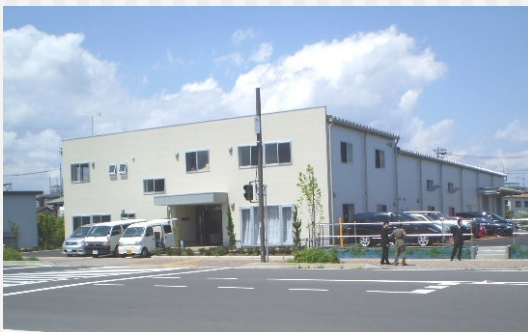
Warehouse & Factory

Pharmaceuticals Intermediates Nutritionals and Health Care Chemicals General Consumer Products