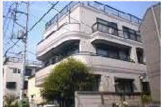
Tokyo Head Office

Import and Export Distribution Licensing Registration Lab Representation/Consulting Marketing Services